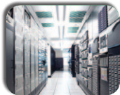
Data Center Management