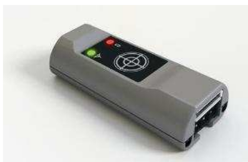
Geo F2 Pill Bottle Covert GPS Tracker

Online monitoring solutions provider, FreightWatch Security Net, has introduced new sensor peripheral products for its "Pill Bottle" Tracker.