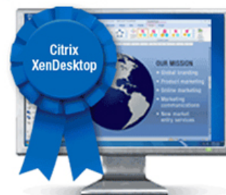
Citrix XenDesktop 4 with HDX