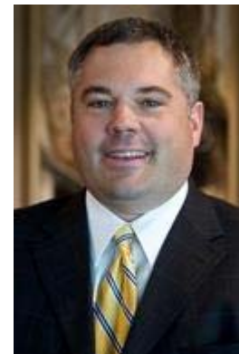
an Ma 2 m

ZigBee is the global wireless language connecting dramatically different