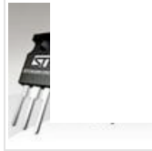
STGW30N120KD and STGW40N120KD Insulated Gate Bipolar ...