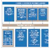
Intel Atom Processor CE4100