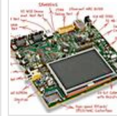
Atmel SAM9G45-EK Evaluation Kit