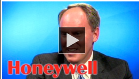
Honeywell's On Top Of Innovation

Forbes VIDEO NETWORK POWERED BY R2 INTEGRATED