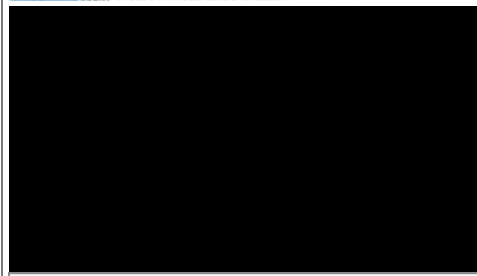
The High Pain Of Low Interest Rates