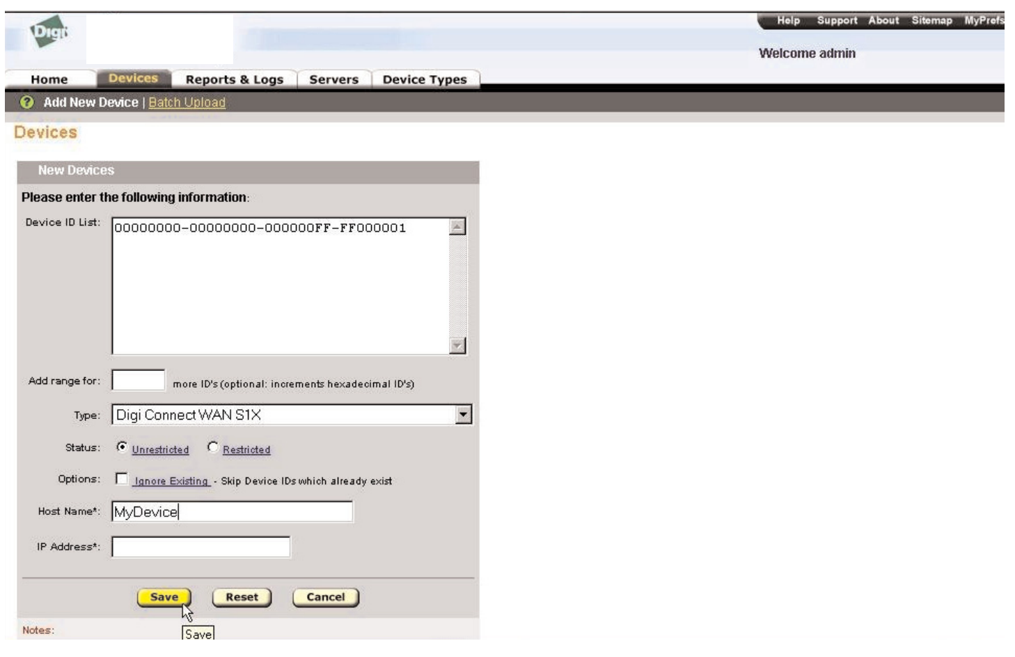
Figure 3 - Host Name Setup