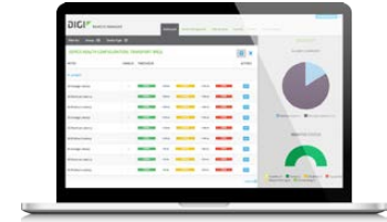
Dashboard displays status of field devices and lets you complete tasks for entire network in minutes

The one place to go to better manage, monitor, configure and protect all your remote devices.